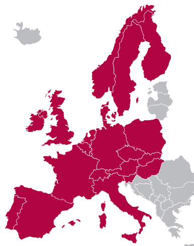
Swiss Life Asset Managers currently holds no assets in Poland, Hungary, Slovenia and Slovakia.