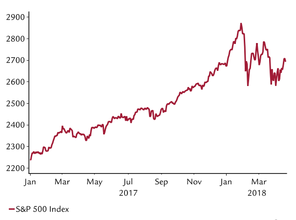
"Buy the dip" mode is still in place